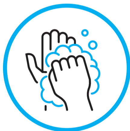
Hygiene and cleaning